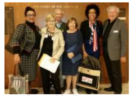
League Members at Legislative Summit