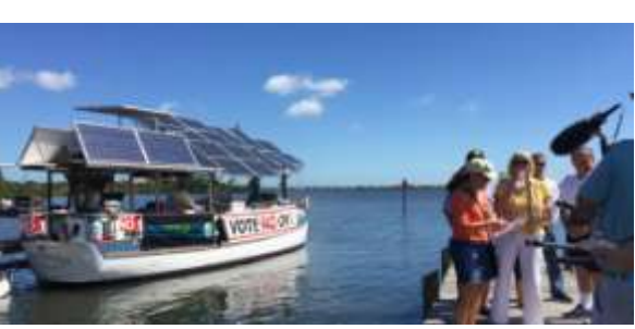
League Members with solar powered boat